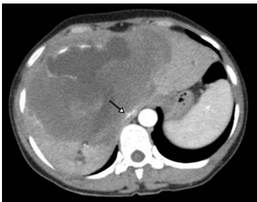
Fig. 1. CT view of liver. Compressed IVC is seen with arrow.